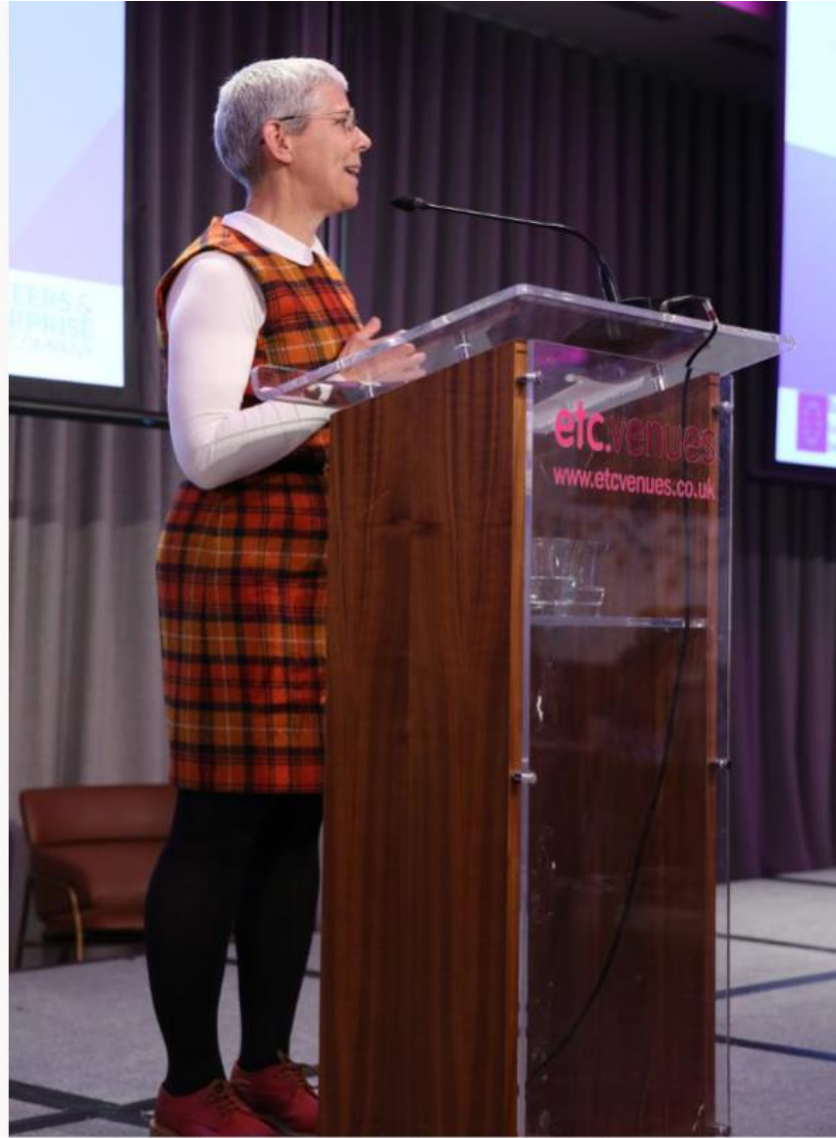
London Careers Educators Conference